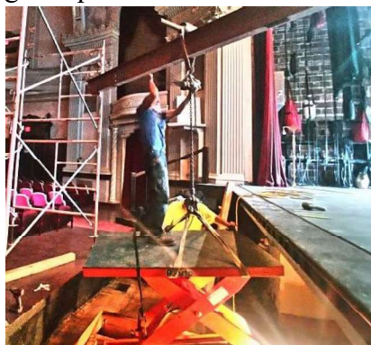
The new lift is lowered in to place

In recent years we've replaced our roof, heating system, sound system and movie screen. Supported in part by a Capital Improvement grant from MACC, in September 2022 we replaced our undersized and under-powered piano lift, making it safer for both our volunteers and piano whenever our restored, 1921 Mason-Hamlin grand piano has to be moved.