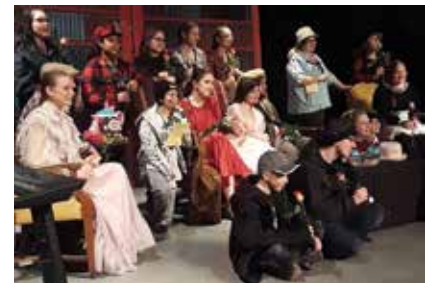
MURDER MYSTERY PERFORMED BY ASDC

This is a follow up to the Peter Yarrow Operation Respect program that was presented at HIT in April 2018. 🎭